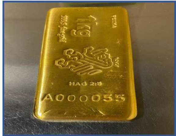
6) Selected 1000g bar for sampling