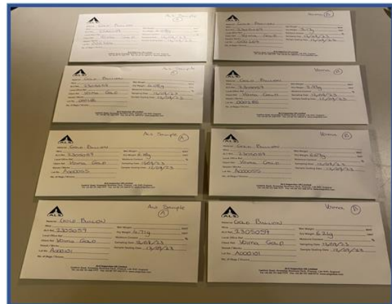
12) All sealed quality sampled