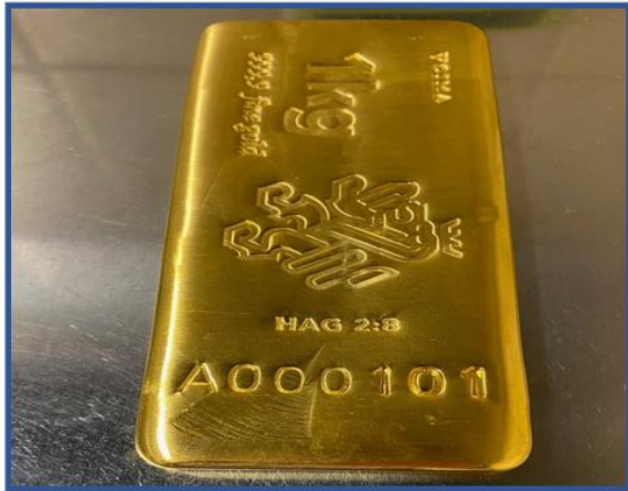
5) Selected 1000g bar for sampling