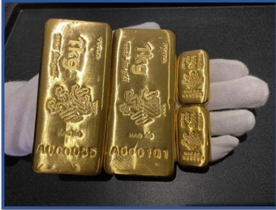
1) Random bars selected from the vault