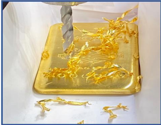
9) A 1000g bar being sampled/drilled