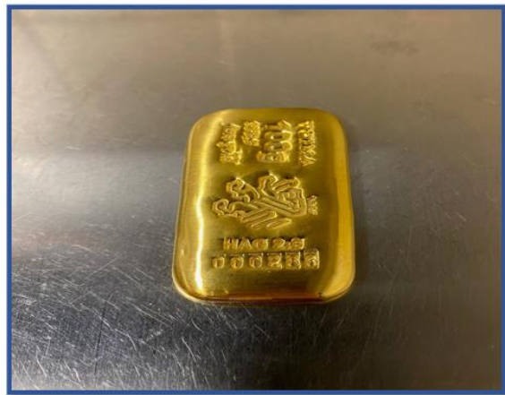
4) Selected 100g bar for sampling