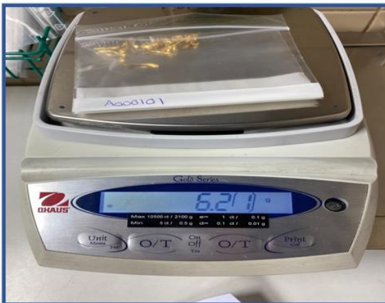
11) A sample of the drilled bar being weighed