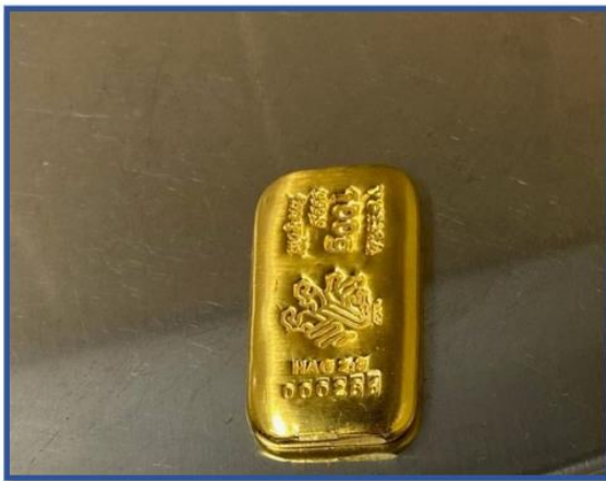
3) Selected 100g bar for sampling