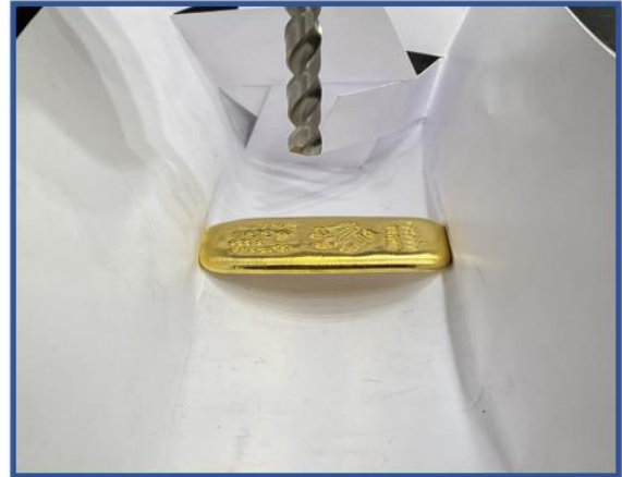
10) A 100g bar being prepared for sampling/drilling