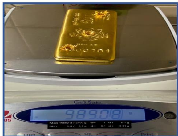
8) A 1000g bar being check weighed post sampling