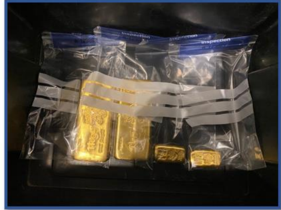
2) Selected bars sealed and placed in a sealed box